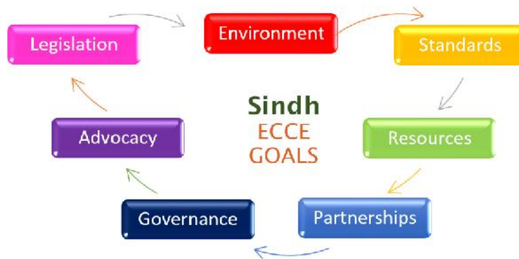
FIGURE 2 SINDH ECCE POLICY GOALS 2015